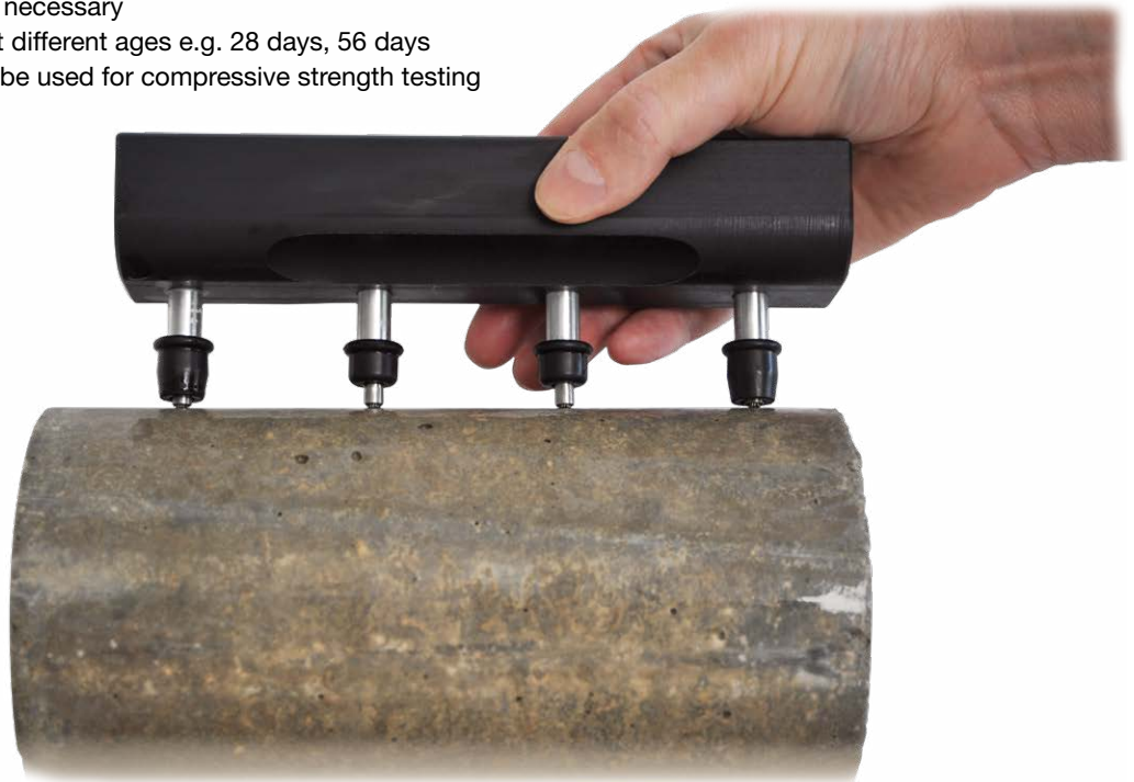
Resipod with 1.5" (38mm) probe spacing is fully compliant with the above mentioned standard