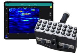
Pundit® PD8000 Basic