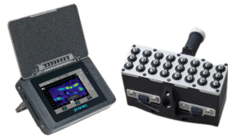
Pundit® 250 Array